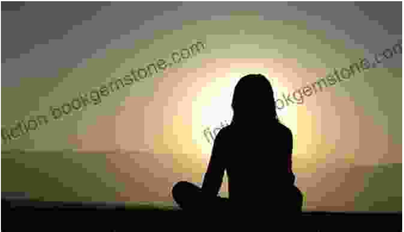
Used under a Creative Commons license.