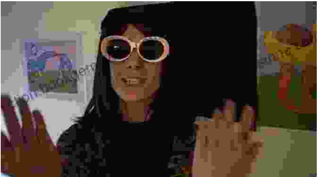
Marishka opening the box of seduction

The Twelve Months With The Box of Seduction is a story about the power of love, courage, and the transformative power of nature. It shows us that even in the darkest of times, there is always hope. And that with a little help from our friends, we can overcome any obstacle.