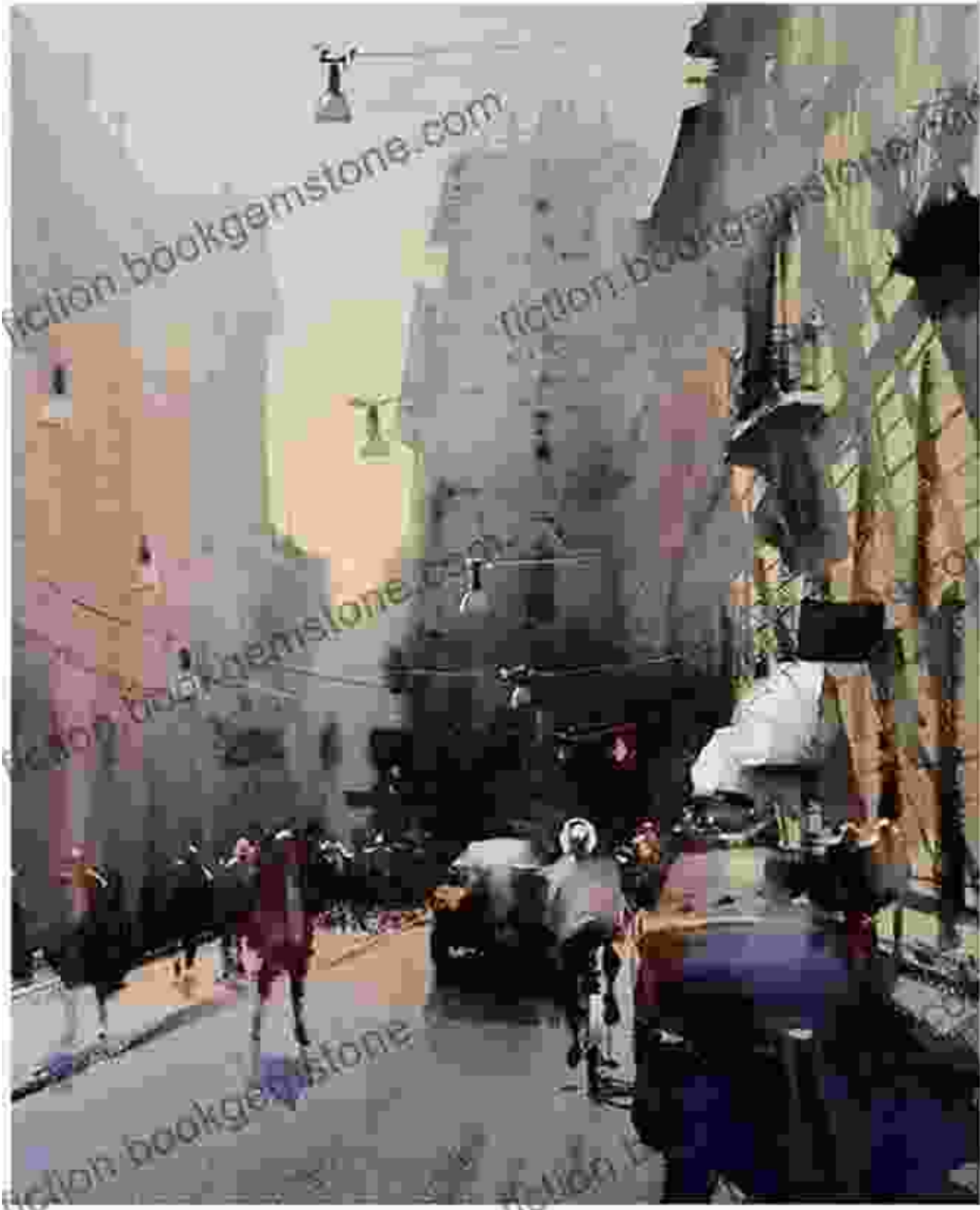
"Figure" by Alvaro Castagnet