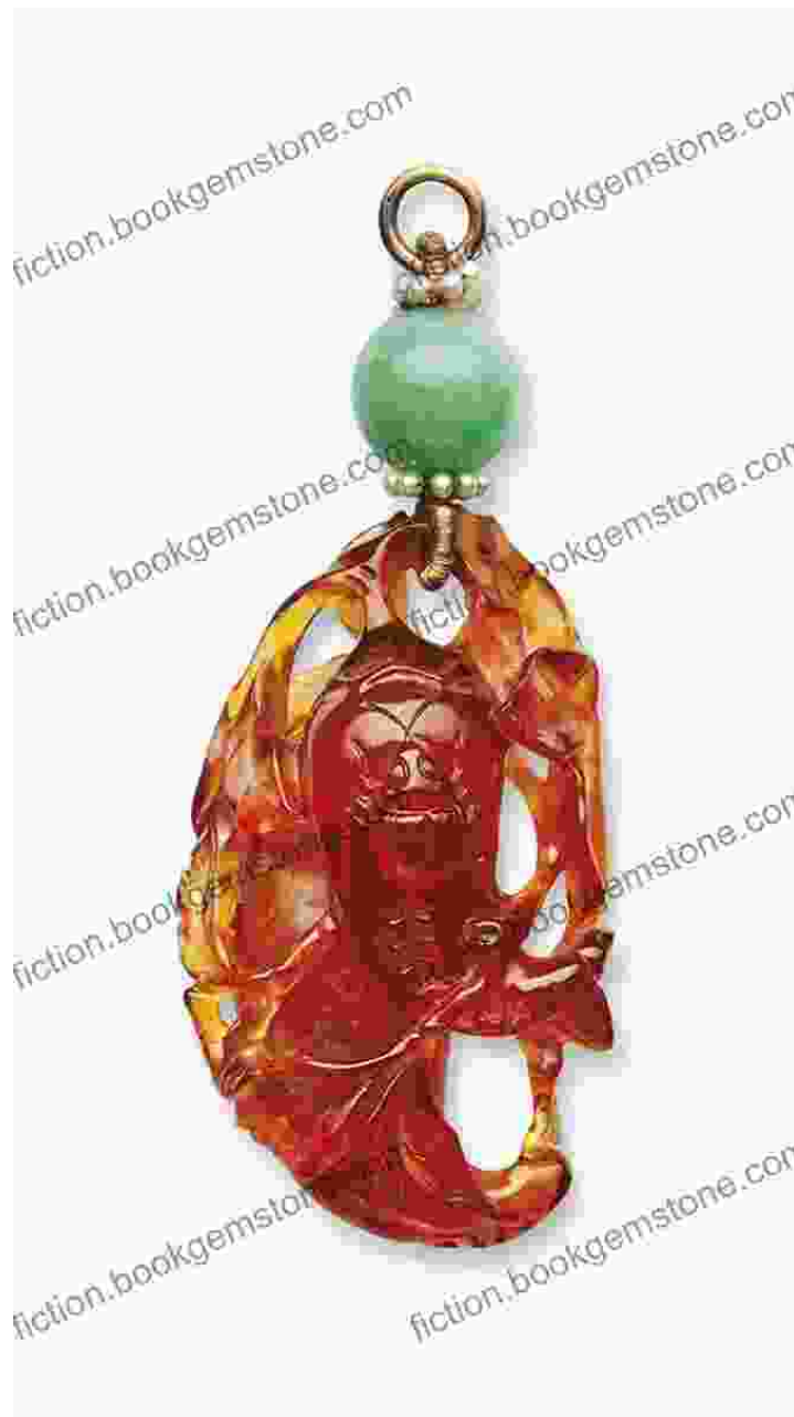
Amber Venus Pendant