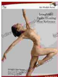
Figure Drawing Pose Reference: The Key to Mastering Human Anatomy in Your Art